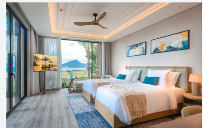
Mock-up villas interior