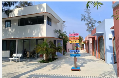
The Thon Village